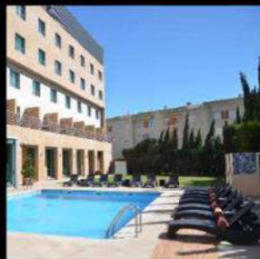
REAL OEIRAS HOTEL ****