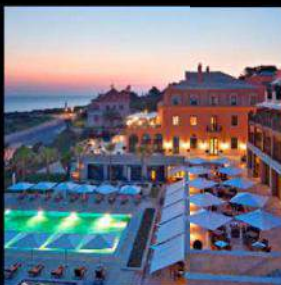
GRANDE REAL VILLA ITÁLIA HOTEL & SPA *****