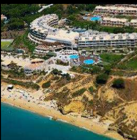
GRANDE REAL SANTA EULÁLIA RESORT & HOTEL *****