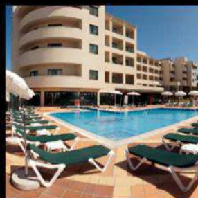
REAL BELLAVISTA HOTEL & SPA ****