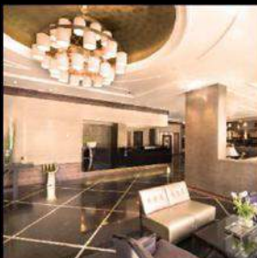
REAL PARQUE HOTEL ****