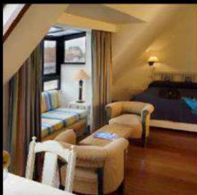
REAL RESIDÊNCIA APARTAMENTOS TURÍSTICOS