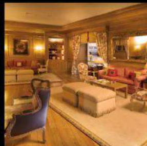
REAL PALÁCIO HOTEL *****