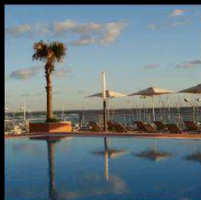
REAL MARINA RESIDENCE & REAL MARINA RESORT & HOTEL SPA *****